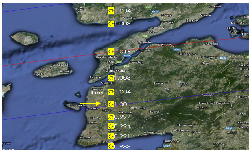
Figure 3. Troy's area. The central line depicts the central path of the total eclipse on the 24 th of June 1312 yr B.C. reaching the maximum magnitude ( http://eclipse.gsfc.nasa.gov ). The symmetric lines, with respect the central, are totality's northern and southern limits respectively. The longitude is the same for all positions. The arrow to the south of the totality's southern limit shows a region in which Herrinkson (2012) sets a part of the fighting armies.