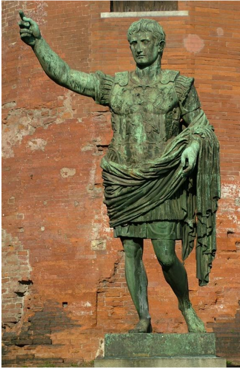
Statue of Augustus at the Palatine Gate, Turin