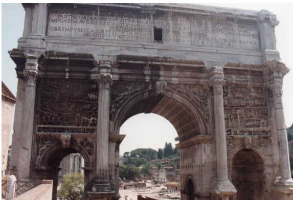
Arch of Septimius Severus, Rome