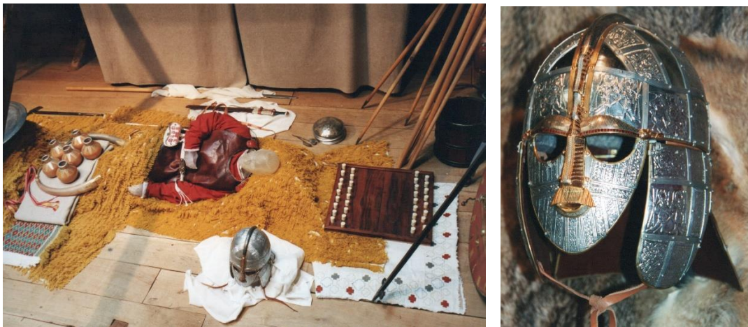
Reconstruction of Royal Anglo-Saxon Ship-Burial at Sutton Hoo

Returning to the account of Frankish history by Fredegar, he reported that Dagobert died in the 16 th year of his reign at his villa near Paris. His young son, Clovis II, became king of Neustro-Burgundy, with his mother Nanthild as regent. Dagobert’s elder son, Sigibert III, who had been given authority over Austrasia in his father’s 11 th year, was confirmed as king of that country. It was agreed that Dagobert’s treasure would be shared between Nanthild, Clovis and Sigibert, and Pippin was sent to ensure that Sigibert received his fair share. Fredegar noted that Pippin died in the following year. He also recorded that, in the 3 rd year of Clovis (which would correspond to AM (E) 5841, i.e. AD 641, on the basis of the timescale since the end of Gregory’s History ), Constans II became emperor in Constantinople, and that, at about the same time, Chindasuinth seized the throne of the Visigoths from Tulga. Consistent with that, the Mozarabic Chronicle dated the accession of Chindasuinth to Spanish Era 680 (AD 642), also noting that, by this time, the Saracens had conquered large parts of North Africa. In Italy, Rothari succeeded Arioald as the Lombard king. Paul reported that Rothari re-established Arianism as the Lombard religion and, soon after the start of his 16-year reign, introduced a code of laws, in the 77 th year after the arrival of the Lombards in Italy. That would be in about AD 646, counting from the date given by Marius for the invasion [139].