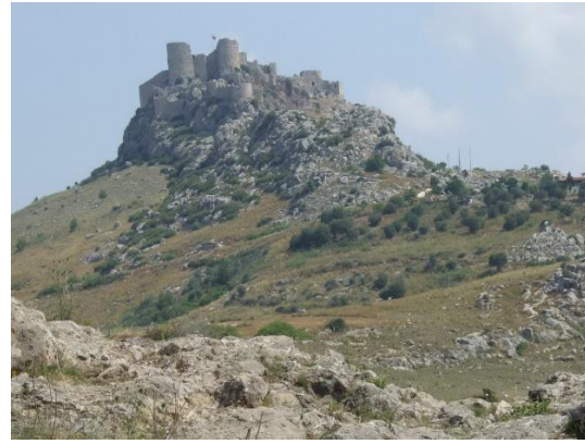
Amongst the castles built by the Crusaders were Al-Kerak (left) in Jordan and Yilanlikale Castle (right) in Cilicia.