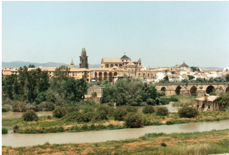
View of Córdoba, Spain, looking towards the magnificent Mezquita, now the city's Cathedral, but constructed by the Umayyad's as a Muslim mosque on the site of a Visigoth church.