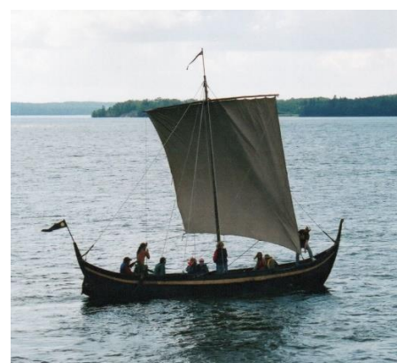
Replica of a Viking boat, Birka, Sweden