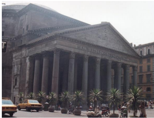
The Roman Pantheon, built during the reign of Emperor Hadrian and converted by Pope Boniface IV, with the approval of Emperor Phocas, into the Church of St Mary and the Martyrs