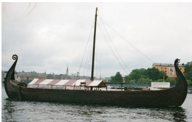
Replica of a Viking ship, Stockolm, Sweden