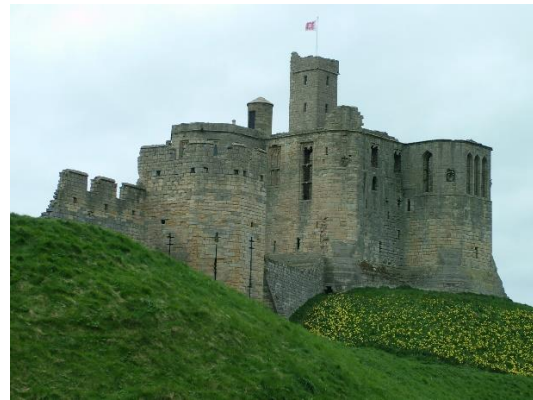
After the Battle of Hastings, William and his Norman successors began building castles of stone throughout England, such as those as Barnard Castle (left) and Warkworth (right), both in Northumberland.