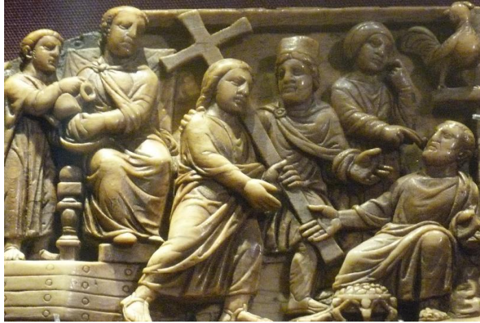
Late Roman ivory panel, now in the British Museum

The term “barbarian” was coined by the ancient Greeks to refer to foreigners, i.e. people who spoke a language other than Greek. Although it was a term of disparagement, implying that barbarians were less cultured than the Greeks, there was no suggestion that barbarians were entirely lacking in culture. The Achaemenid Persians, for example, were called barbarians by the Greeks. The Romans eventually took over the term, regarding people who were unwilling to become assimilated into the Roman Empire and accept the Roman way of life as barbarians. During the early part of the Roman Empire, the term was increasingly used in connection with the Germanic tribes such as the Alamanni, Franks and Burgundians, who lived east of the Rhine, and other Germanic tribes such the Goths, Gepids and Vandals, who lived to the southeast of these, in the regions north of the Danube [97].