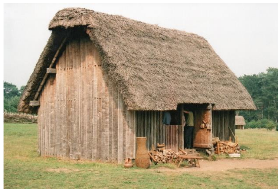
Characteristic timber-framed buildings in a typical Angle-Saxon village re-created at West Stow, Suffolk

King Edward soon married Edith, daughter of Godwin, earl of Wessex, but they had no children. Meanwhile, in the 8 th year of Cnut, as reported by Henry of Huntingdon, Richard II had been succeeded as duke of Normandy by his son, Richard III, for a few months, and then by his brother Robert I. When Robert died 8 years later, his young son, William, became duke. William went on to claim the status as heir to the English throne, since both he and Edward were direct descendants of Richard I of Normandy. However, when Edward died after reigning for 24 years, the English nobles immediately gave the throne to Harold, who had succeeded his father, Godwin, as earl of Wessex. William sailed across the Channel and defeated Harold’s army, taking the English throne and becoming known as William the Conqueror. The Anglo-Saxon Chronicles , Henry of Huntingdon, John of Worcester and Roger of Wendover, as well as William of Newburgh, Walter of Guisborough, Frutolf of Michelsberg, Alberic of Trois-Fontaines and the Saxon Annals , all dated William’s victory to AD 1066; Marianus Scotus gave it as VA 1089 (AD 1067) [178].