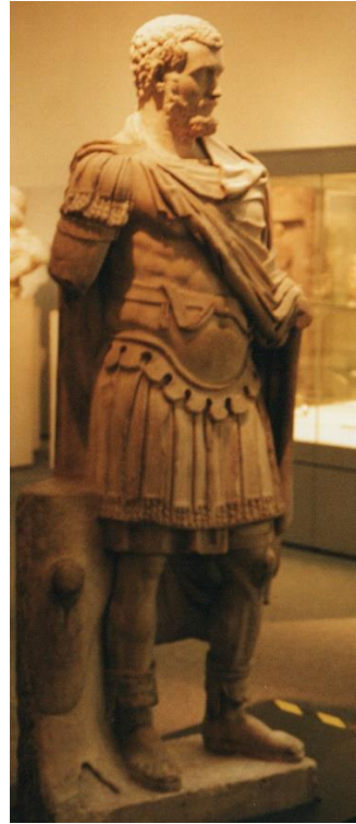
Statue of Septimius Severus in the British Museum

Sections of the period from the reign of Octavian/Augustus, the first Roman emperor, to that of Septimius Severus, were covered in surviving reports written during the course of it by Suetonius, Tacitus and Plutarch. The whole period was covered by Cassius Dio, who lived during and soon after the reign of Septimius, although the latter part of his history has survived only in the form of epitomes. It was also covered by historians such as Eusebius, Eutropius and Aurelius Victor, who, according to their own surviving accounts, lived three centuries after the death of Octavian/Augustus; and by Orosius, Prosper of Aquitaine and the anonymous author of an epitome of the lives of the early Roman emperors (sometimes erroneously associated with Aurelius Victor), who lived up to a century later. Subsequent historians, sometimes explicitly, used these various accounts as sources [40].