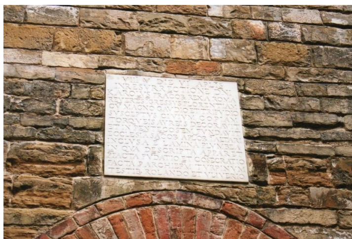
Section of the Carolingian walls of Florence, constructed after Florence, previously a city of Lombardy, had become part of the Carolingian Empire.

Afterwards, on Christmas Day, they all gathered together once more in St Peter's. Leo placed a crown on the head of Charlemagne, and the Romans cried out, "To Charles, pious Augustus crowned by God, great and pacific Emperor, life and victory!" Thus Charlemagne was established as Roman Emperor. According to Theophanes, that coronation took place on Christmas Day in AM (AE) 6293 (AD 800/1), which, as we have previously noted (section 3.2.1), is consistent with the accounts given in the Royal Frankish Annals and the Annals of Lorsch [246].