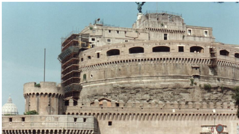
The Castel Sant'Angelo in Rome, originally constructed as the Mausoleum of Emperor Hadrian.