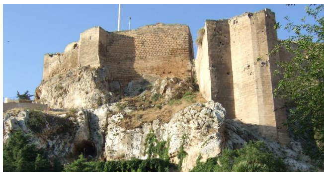
Citadel of Edessa (Sanliurfa. Turkey)

At the time when Bernard of Pisa, a Cistercian monk who had been a pupil of Bernard of Clairvaux, was consecrated as Pope Eugene III, there was much civil unrest in Rome. It was said that his predecessor, Pope Lucius II, had been killed by a stone thrown during a riot. Revolutionary fervour was being whipped up by Arnold of Brescia, who was arguing that Rome should return to having a secular government, with the church's authority being limited to spiritual matters. The situation was such that Eugene chose to spend much of his pontificate in other parts of Italy and in France. While he was in France, the Turks conquered the Christian state of Edessa which had been established during the First Crusade. Eugene called for a Second Crusade to bring it back into Christian hands, and troops set off under the joint command of King Louis VII of France and King Conrad III of Germany, but the Second Crusade was a failure. On his return to Italy, Eugene died in Tivoli and was succeeded by the elderly dean of the Cardinals, who became Pope Anastasius IV. Alberic, the Royal Chronicle of Cologne , the Chronicle of Usperg and the Chronicle of Otto of St Blasien dated this transition to AD 1153 whilst Roger and the anonymous Flowers of History placed it in the previous year [312].