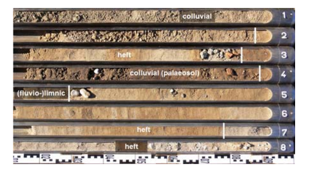
Fig. 2: Facies distribution pattern of vibracore ALP 8 (38.37 m a.s.l.) drilled on top of the Olympia terrace to the west of the Kladoes River some 250 m to the west of the Kronos hill. Several sandy to gravelly high-energy flood type (heft) deposits can be seen alternating with fine-grained colluvial or (fluvio-)limnic deposits. The mid-core palaeosol dates to Roman times. Please note the three fining upward sequences encountered in the uppermost heft unit.

Geomorphological studies carried out within our project revealed erosion as well as scouring features across the lower saddles of the Flokas-Platanos Ridge lying at about 60 m a.s.l. which indicate possible flow paths across the ridge.