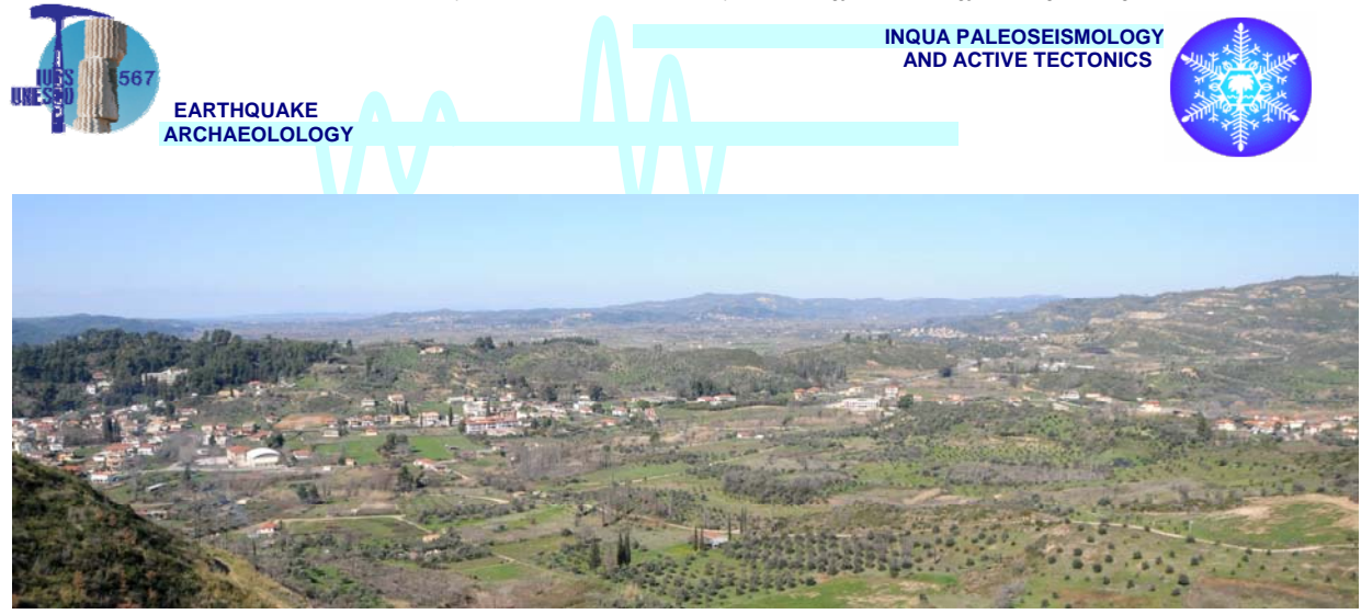
Fig. 1: View of the middle Kladeos River valley (foreground) towards the west. The valley is separated from the adjacent Basin of Flokas-Pelopio (middleground) by the homonymous ridge. The Alpheios River valley connects the basin and the Gulf of Kyparissia (left background) in a direct line. Photo taken by A. Vött, 2011.

In the more seaward vibracore ALP 7, drilled some 8 km inland in the midst of the Alpheios River valley halfway between ALP 9 and the present coast, we found autochthonous marine sand at approx. 2.50 m below present sea level (m b.s.l.). Covered by a 10 m-thick layer of sandy gravel, this unit documents that the Gulf of Kyparissia extended far into today's Alpheios valley during the Holocene.