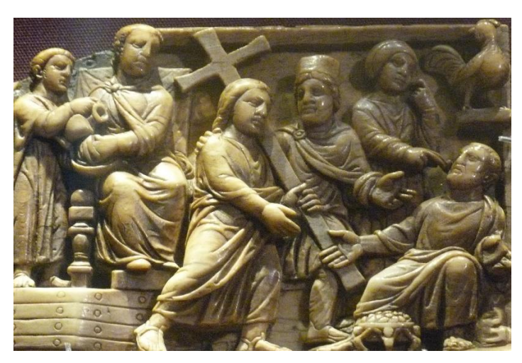
Late Roman ivory panel, now in the British Museum

The term "barbarian" was coined by the ancient Greeks to refer to foreigners, i.e. people who spoke a language other than Greek. Although it was a term of disparagement, implying that barbarians were less cultured than the Greeks, there was no suggestion that barbarians were entirely lacking in culture. The Achaemenid Persians, for example, were called barbarians by the Greeks. The Romans eventually took over the term, regarding people who were unwilling to become assimilated into the Roman Empire and accept the Roman way of life as barbarians. During the early part of the Roman Empire, the term was increasingly used in connection with the Germanic tribes such as the Alamanni, Franks and Burgundians, who lived east of the Rhine, and other Germanic tribes such the Goths, Gepids and Vandals, who lived to the southeast of these, in the regions north of the Danube [97].