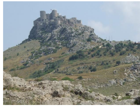
Amongst the castles built by the Crusaders were Al-Kerak (left) in Jordan and Yilanlikale Castle (right) in Cilicia.