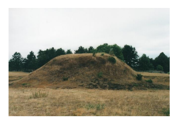
Society for Interdisciplinary Studies