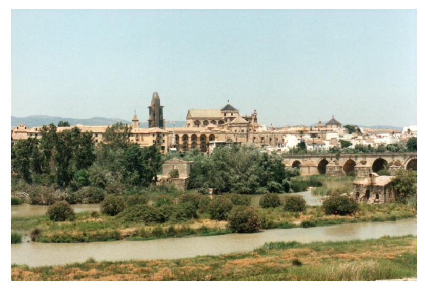
View of Córdoba, Spain, looking towards the magnificent Mezquita, now the city's Cathedral, but constructed by the Umayyad's as a Muslim mosque on the site of a Visigoth church.

his reign, which he did with great success for 52 more years, establishing Oviedo as his capital and winning significant victories over the Moors. Rodrigo gave a similar account, but with slightly lower dates [143].