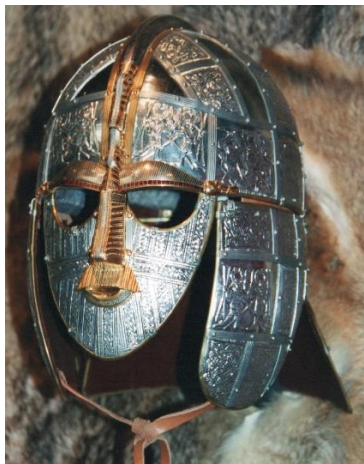
Reconstruction of Royal Anglo-Saxon Ship-Burial at Sutton Hoo