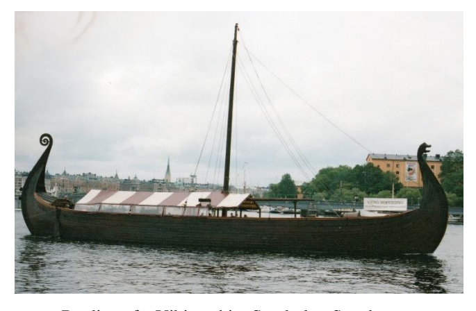
Replica of a Viking ship, Stockolm, Sweden