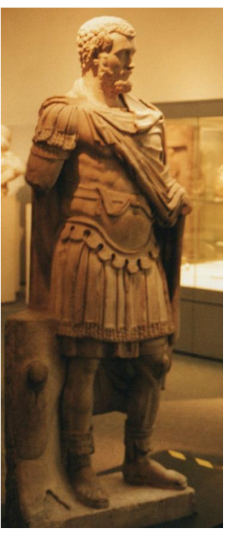
Statue of Septimius Severus in the British Museum

Sections of the period from the reign of Octavian/Augustus, the first Roman emperor, to that of Septimius Severus, were covered in surviving reports written during the course of it by Suetonius, Tacitus and Plutarch. The whole period was covered by Cassius Dio, who lived during and soon after the reign of Septimius, although the latter part of his history has survived only in the form of epitomes. It was also covered by historians such as Eusebius, Eutropius and Aurelius Victor, who, according to their own surviving accounts, lived three centuries after the death of Octavian/Augustus; and by Orosius, Prosper of Aquitaine and the anonymous author of an epitome of the lives of the early Roman emperors (sometimes erroneously associated with Aurelius Victor), who lived up to a century later. Subsequent historians, sometimes explicitly, used these various accounts as sources [40].