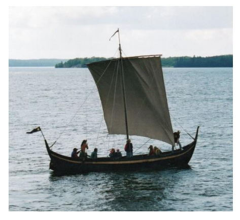
Replica of a Viking boat, Birka, Sweden